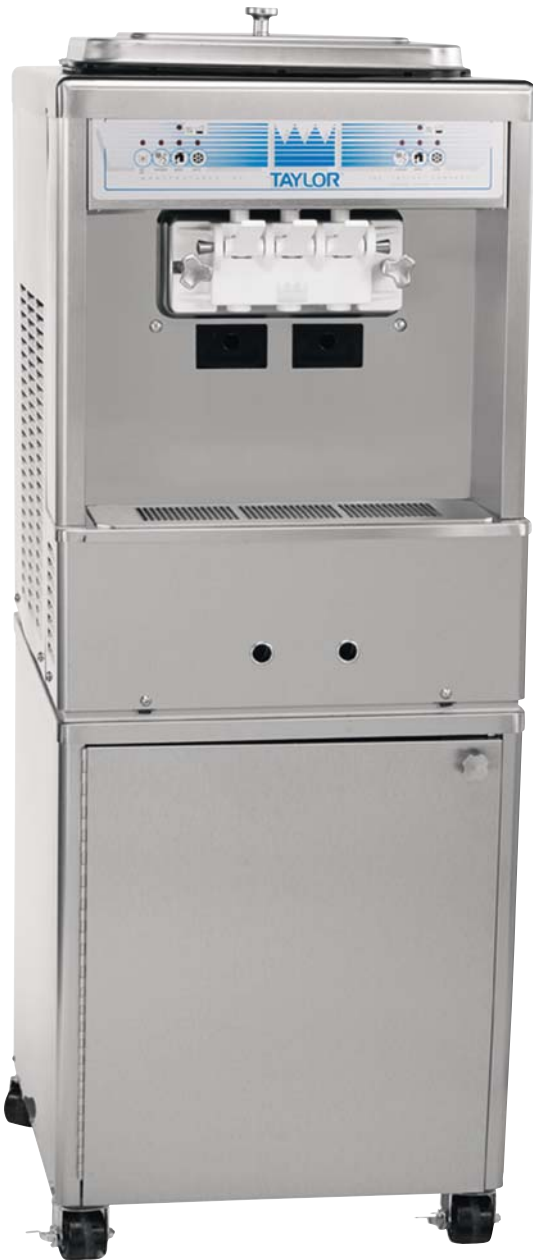
Photo shows Model 161 with optional cart

Easily removable, cleanable air filter helps keep condenser clean for optimal refrigeration system performance.