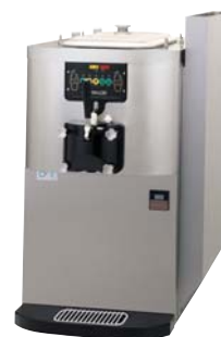
Optional Top Air Discharge Chute

Rockton, Illinois 61072 800-255-0626 Phone 815-624-8333 Fax 815-624-8000 www.taylor-company.com e-mail: info@taylor-company.com