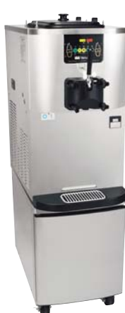
Optional Cart with front opening door

Hopper temperature is displayed to assure safe product temperatures. Indicator may be switched from Fahrenheit to Celsius temperature display.