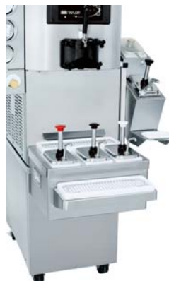
Optional Cart with rear door for front mount syrup rail